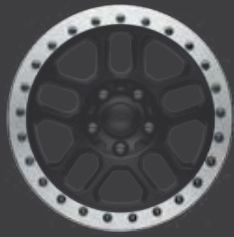
FUNCTIONAL BEADLOCK RING KIT (2)(10) Shown on 17-inch Beadlock-Capable Wheel. [ P5160154AA ]