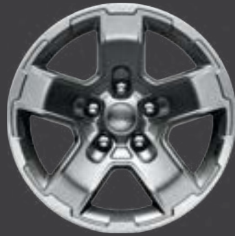
17-INCH GEAR DESIGN OFF-ROAD WHEEL (9) [ 77072471AB ]