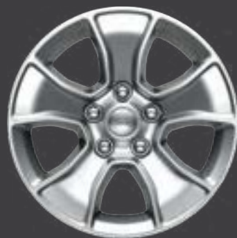
17-INCH SILVER OFF-ROAD WHEEL (9) [ 77072472AB ]