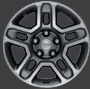
17-INCH SLOTTED OFF-ROAD WHEEL (9) [ 77072494AB ]