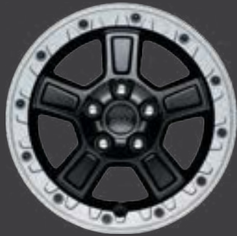
17-INCH BEADLOCK- CAPABLE WHEEL (9) [ 77072585AA ]