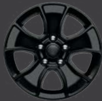
17-INCH BLACK OFF-ROAD WHEEL (9) [ 77073002AA ]