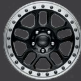
17-INCH BEADLOCK- CAPABLE WHEEL (9) [ 77072494AB ]